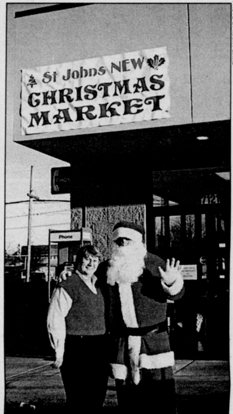
Santa finds out who's been nice at the St. Johns Christmas Market