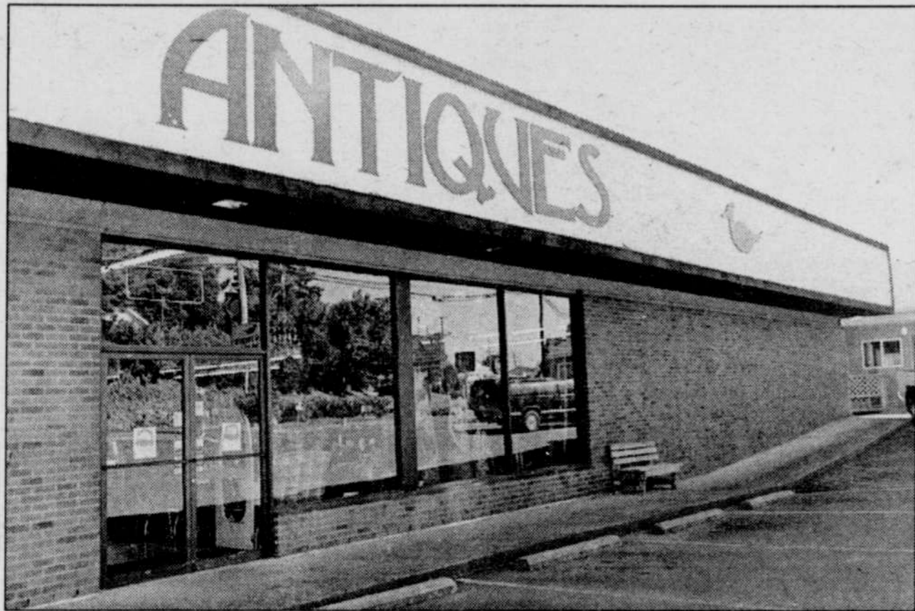
The Little Antique Mall has grown from a small antique store into a nationally known business

that much easier to be an out and proud gay male living in a community that I would have never considered growing up in."