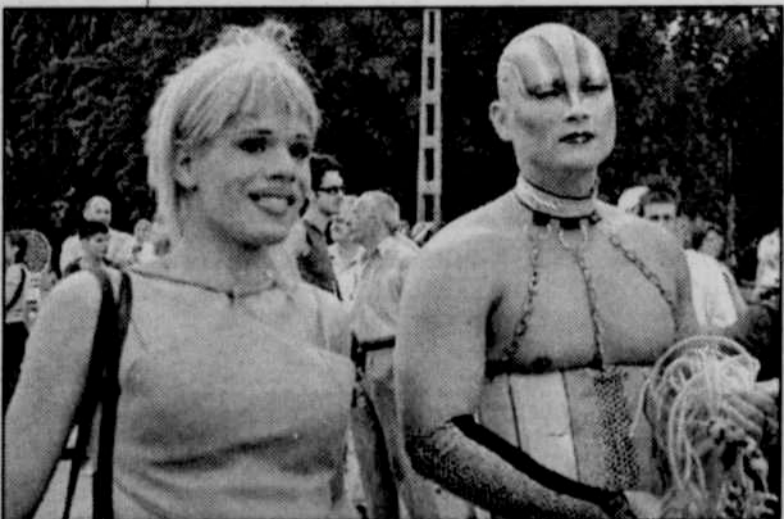
Hungarians celebrate Pride in Budapest