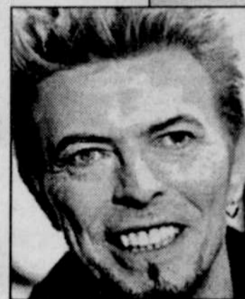
New Wavers David Bowie and Moby rock the Gorge Amphitheatre on Aug. 16

G lam rock queer boy David Bowie joins the ambiguous-about-my-sexuality