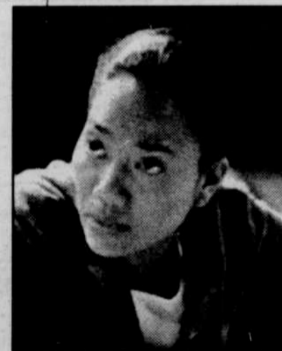
Cute Sonja Sohn plays tough dyke detective in The Wire

The program, which has Greggs teaming up with West Baltimore's Homicide Department to bring down the city's major drug ringleader and his crew, airs at 10 p.m. Sundays. If you've missed the first few, don't fret: You can get caught up with