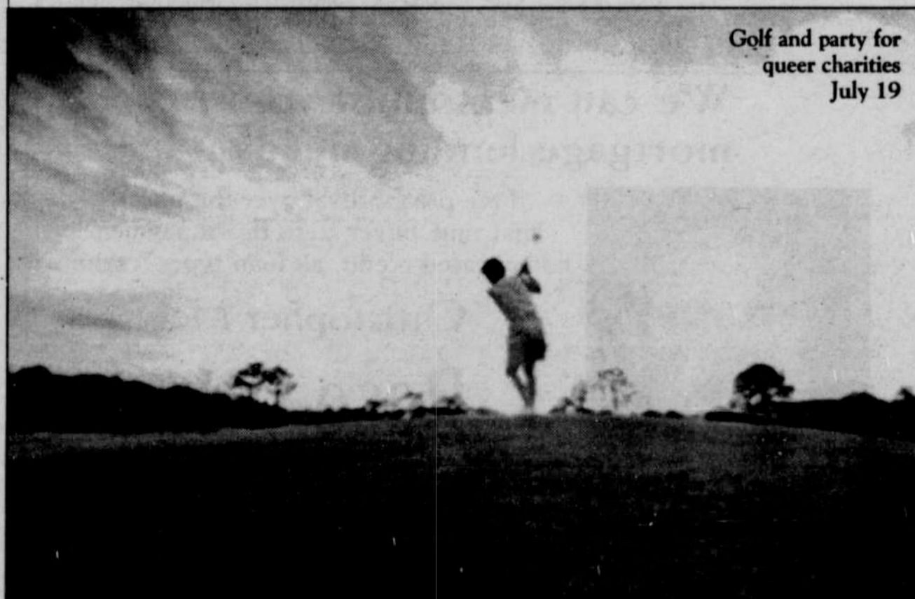
Golf and party for queer charities July 19