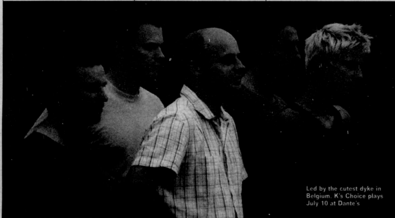
Led by the cutest dyke in Belgium, K's Choice plays July 10 at Dante's

Performance Works NorthWest presents Cabaret Boris & Natasha , a star-studded dance and performance art event, through July 13 to benefit its