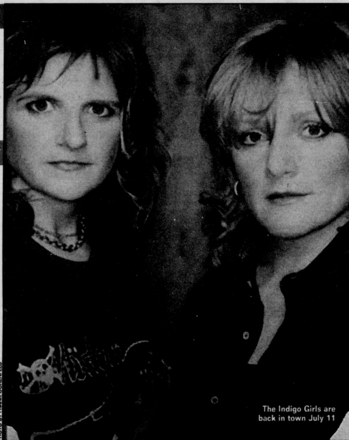
The Indigo Girls are back in town July 11

Belgian band K's Choice , led by the cutie-cute dyke Sarah Bettens, plays Dante's. (9 pm. 1 SW Third Ave. Call 503-226-6630 for cover.)