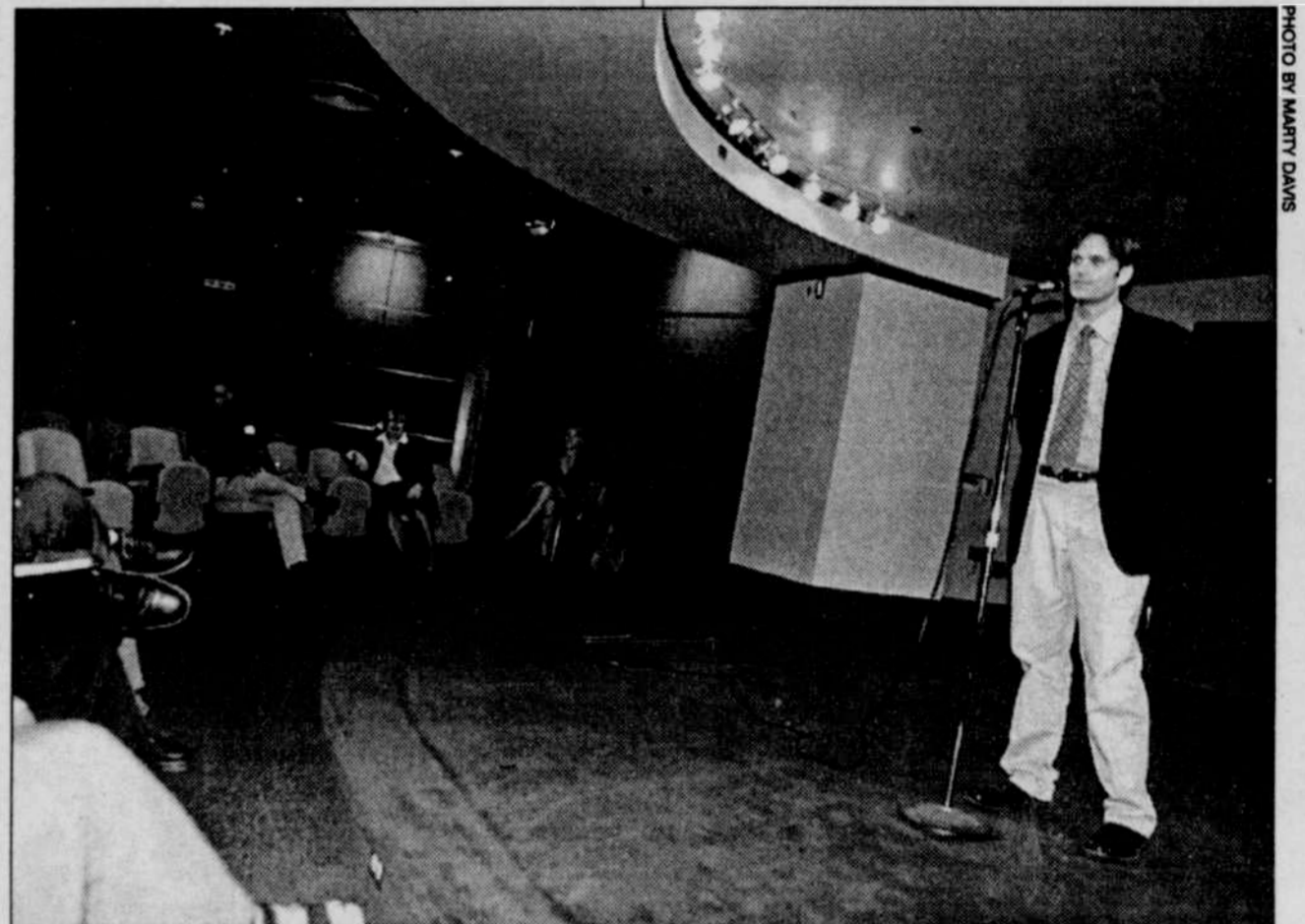
Sam Adams commemorates National Pride Month on June 26 at City Hall