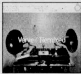
VERVE REMIXED Various Artists • Verve Music Group

This has got to be one of the most ingenious ideas ever floated by a greedy record company executive desperate to cash in on songs that otherwise would be locked away in a vault collecting dust. Verve Music invited the world's most talented DJs and producers to tinker with their original landmark recordings and create all-new classics.