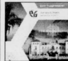
PARTY GROOVE: THE WHITE PARTY Various Artists • Centaur Entertainment

"Groovejet (If This Ain't Love)" by DJ Spiller reminds me of every disco classic from my childhood. And Sarah McLachlan's "Sweet Surrender" is transported to new heights with an epic, space-age remix.