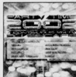
PARTY TIME 2002 Various Artists • Groovili-cious Music

My favorite selection is the trippy "Wonderland" by the Psychedelic Waltons featuring Roisin Murphy. Upon further investigation I realized I was drawn to this track for a good reason: It was co-produced by Nellee Hooper, the mastermind behind some of Madonna, Sinéad O'Connor and Soul II Soul's greatest hits.