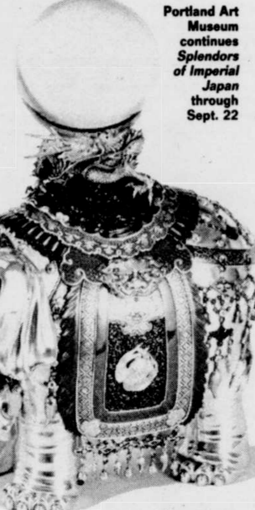
Portland Art Museum continues Splendors of Imperial Japan through Sept. 22

Intersex Initiative Portland is a network of