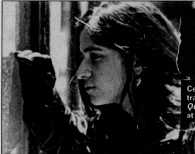
Celebrate gay, lesbian, bi and trans communities of color at Queer Films...in Color! June 29 at Hollywood Theatre

Sunshine, dogs and lesbians: Hike Lewis River Falls with the Forest Group . (Call 541-296-5806 for meeting time and place.)