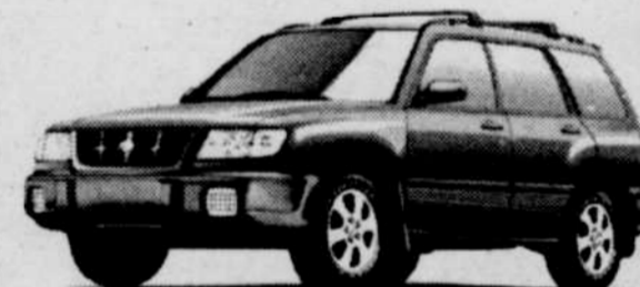
70 Foresters in stock!