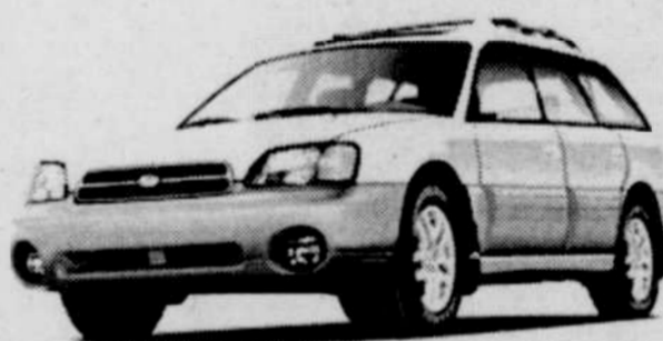
150 Outbacks in stock!

All purchases on advertised vehicles & price must be through internet. This offer not available through the retail sales dept.