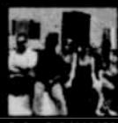
D.P. THE MASSES