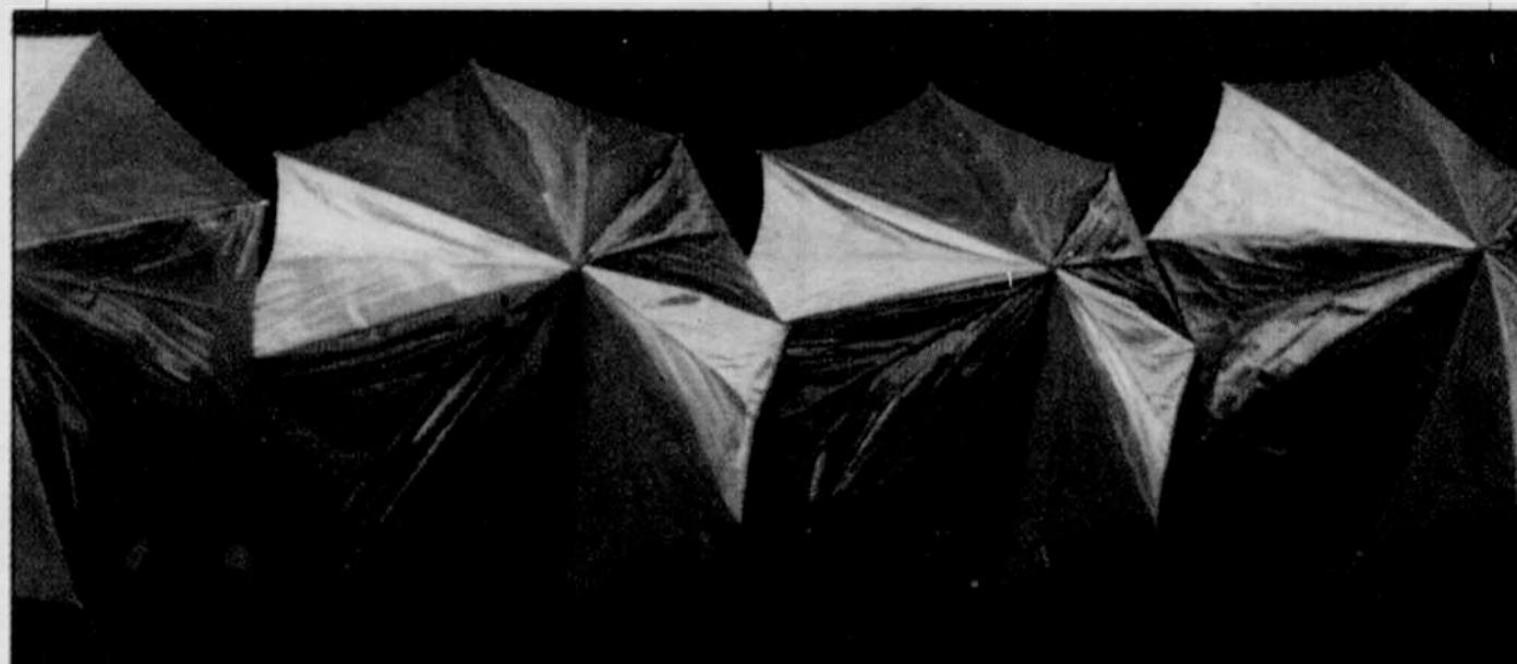
The Portland Gay Men's Chorus predicts rain June 12 and 14, so you might as well attend its events

Remember when your high school principal said you'd go to the prom with your partner "when hell freezes over"? Well, straighten that