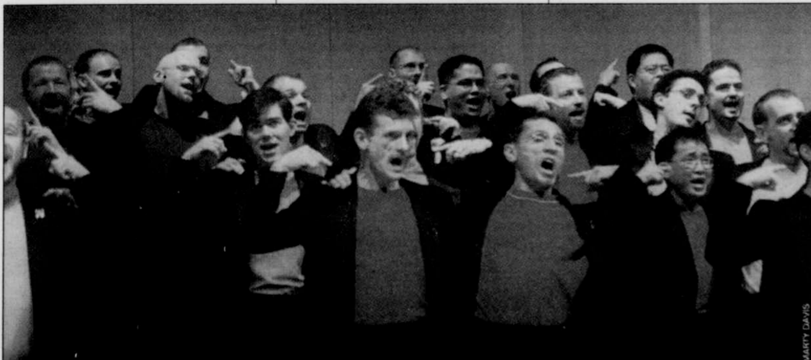
The Portland Gay Men's Chorus tends to go a little nuts this time of year—what with its Voices of Pride concert June 12 and the Rainbow Ball June 14