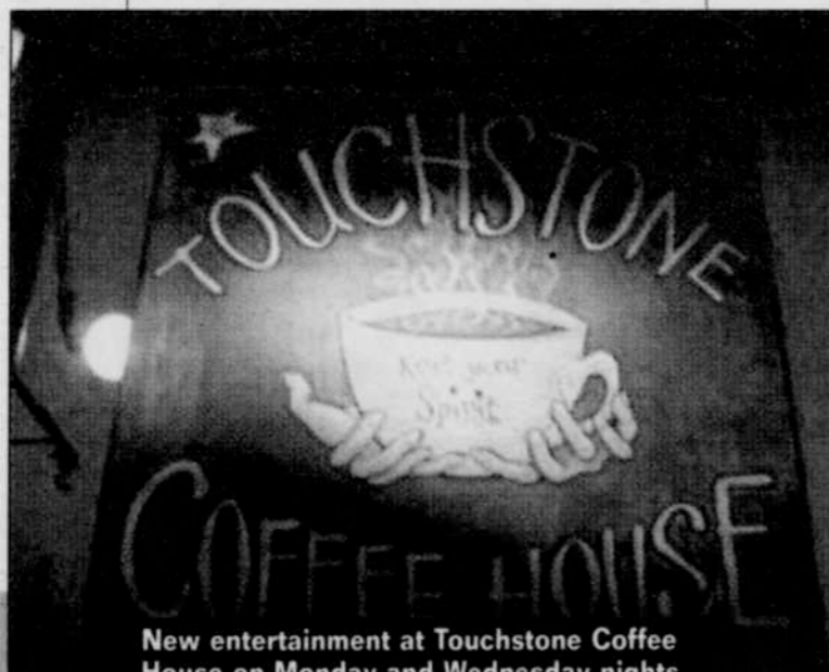
New entertainment at Touchstone Coffee House on Monday and Wednesday nights

Darcelle XV and Co. take their rollicking good time show to the Lucky Fortune Restaurant in Salem. (8 pm. 1401 Lancaster Drive NE. 503-399-9189.)