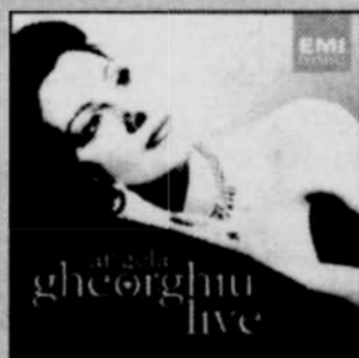
Angela Gheorghiu—Soprano Live from Covent Garden—$13.49 CD