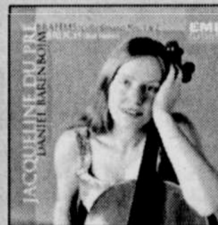
Newly Discovered Recordings of Cellist Jacqueline DuPré $13.49 CD

THOUSANDS OF TITLES ON SALE TO CHOOSE FROM: