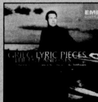
Grieg/Lyric Pieces—Played on the Composer's Piano—$13.49 CD