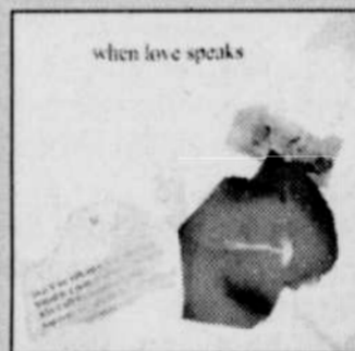
When Love Speaks—Shakespeare's sonnets read by more than 40 well-known actors—$14.99 CD