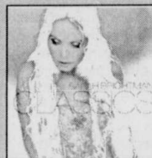
Sarah Brightman—Classics $13.99 CD or $9.99 Cassette