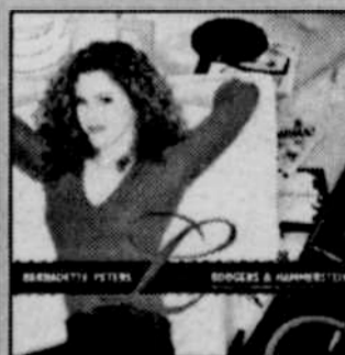
Bernadette Peters sings Rodgers and Hammerstein—$13.49 CD

EMI CLASSICS AND SERAPHIM BUDGET CDS JUST $5.99 EACH OR 3 FOR $17