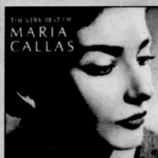
The Very Best of Maria Callas $13.49 CD