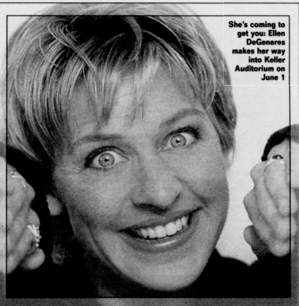
She's coming to get you: Ellen DeGeneres makes her way into Keller Auditorium on June 1