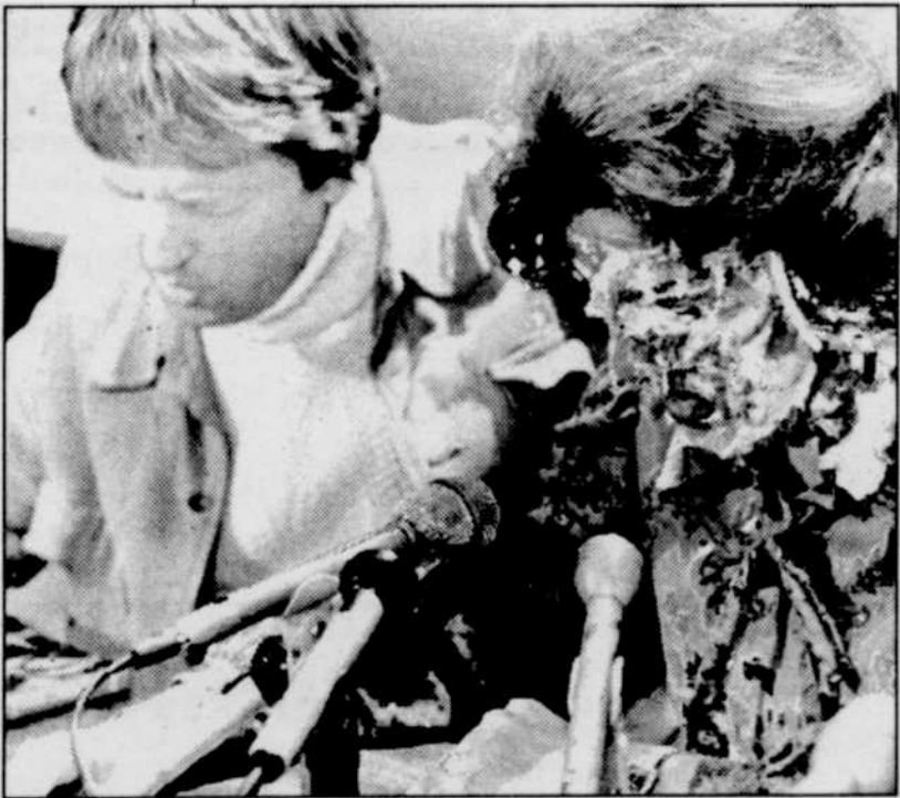
The legacy of Anita Bryant (right, eating humble pie in 1977) continues to vex Miami-Dade County

A nationally recognized pension and health