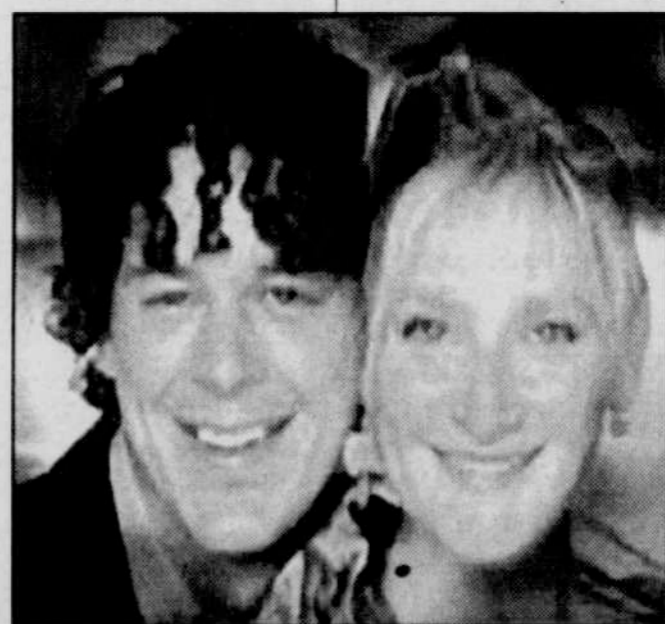
Bob and Rose is like a British Will & Grace —with a twist

Russell T. Davies' Bob and Rose already has aired in Britain and is airing now in Canada. It's about a gay man and a straight woman who fall in love—and go for it.