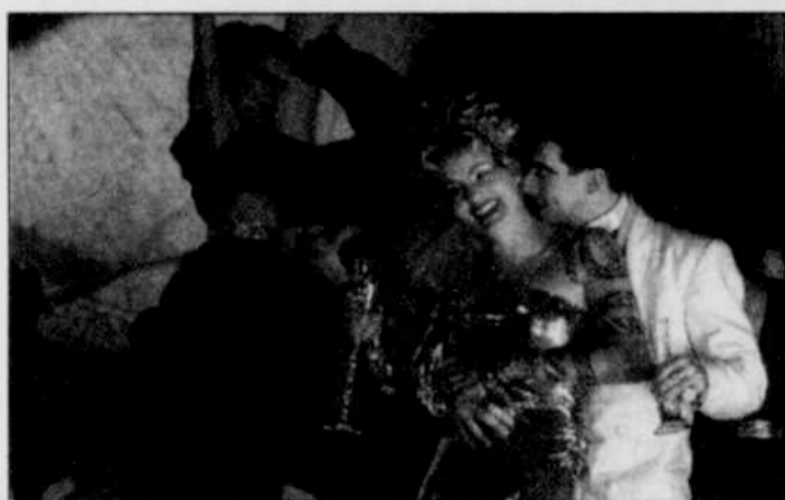
Alan Cumming (right, with Jessica Lange) adds camp to Titus