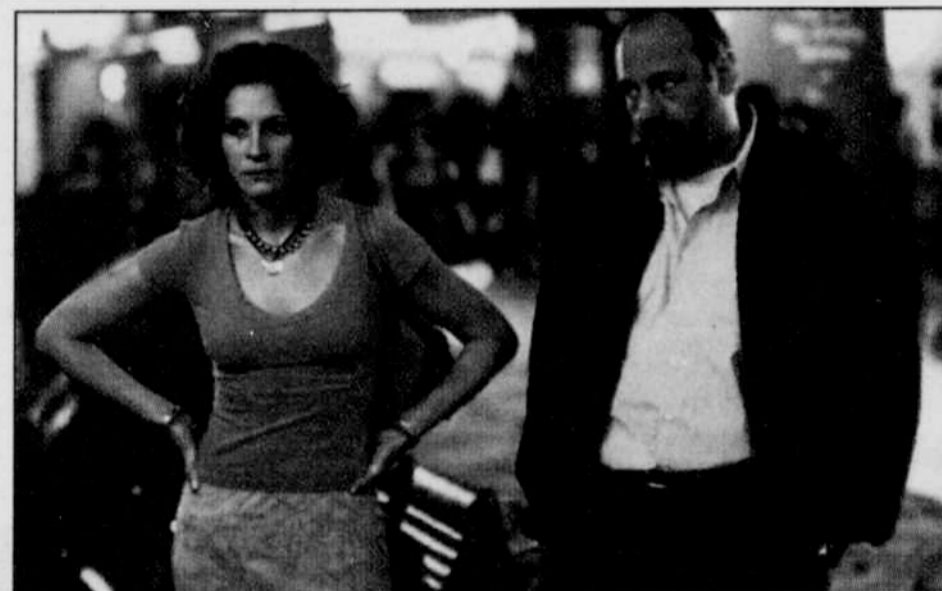
James Gandolfini (right, with Julia Roberts) makes a fine gay hit man in The Mexican

Big Eden is an extraordinary film, impeccably acted with fantastic scenery. (I ought to know—I grew up in Montana, where they shot it.) The two-disc set is packed with extended scenes, director's commentary, a behind-the-scenes documentary, soundtrack, recipes, trailers and more.