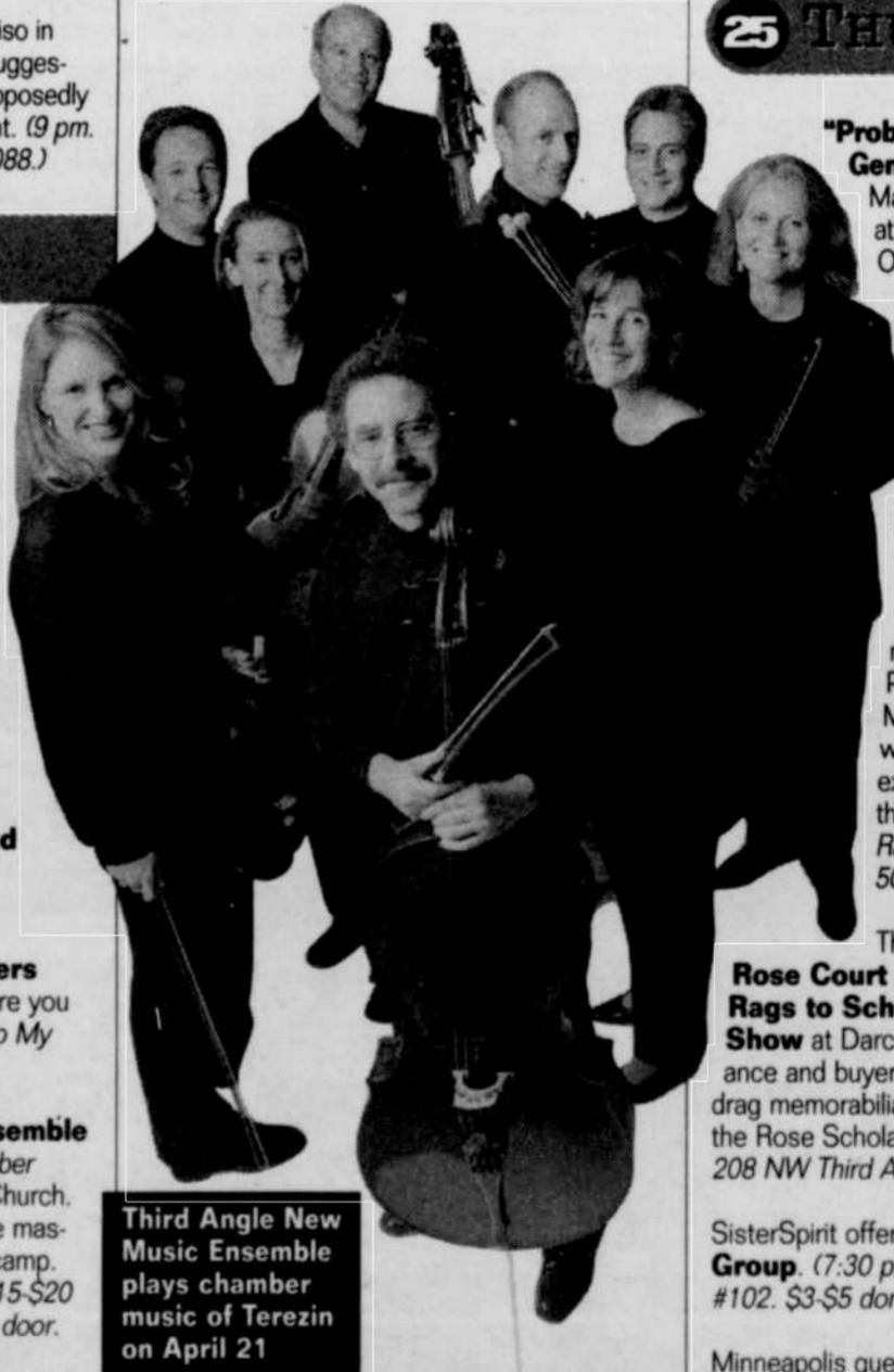
Third Angle New Music Ensemble plays chamber music of Terezin on April 21

Portland State University Queers and Allies sponsor Queer Awareness Week through April 27. It starts with a history lecture (what you didn't learn in high school) and ends with a gay prom (what you didn't have in high school). (See Page 8 for schedule.)