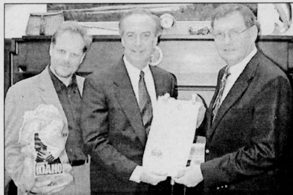
AIDS activists are urging Idaho Gov. Dirk Kempthorne (center, proclaiming April "Couch Potato Month") to protect public health records

The Army's statement regarding the discrepancy stated that the supervisor in charge of processing the discharges thought he was required to "protect the soldiers' privacy" and therefore mislabeled the paperwork. "We are encouraged that