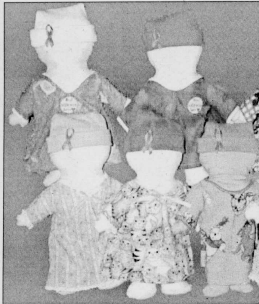
Because the epidemic affects everyone, For Us Northwest's Heal AIDS with Love Dolls come in a variety of ethnicities

For more information visit the Internet site www.motherkalis.com .