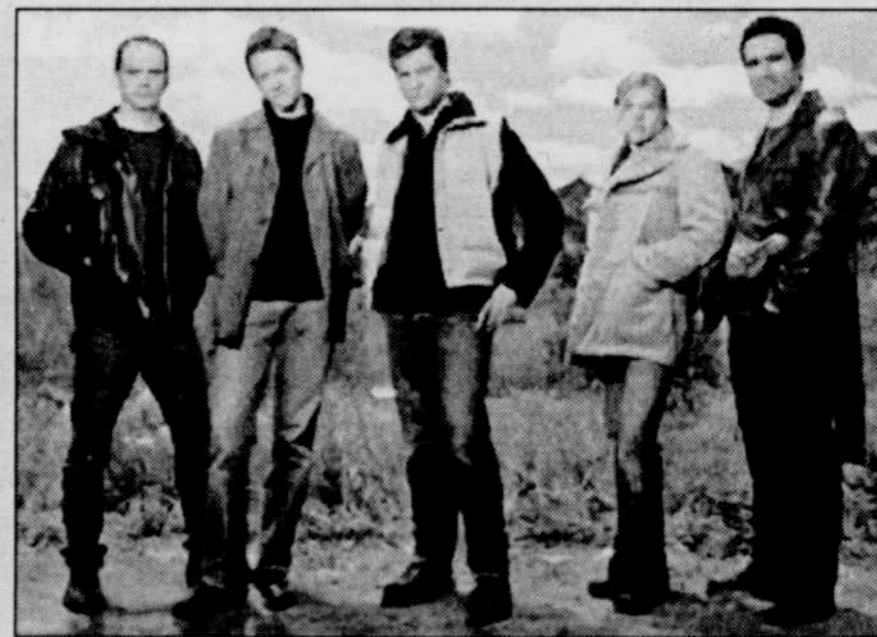
Partial cast of HBO's The Laramie Project

Laramie is an exploration, in part, of why this event in this town sparked international