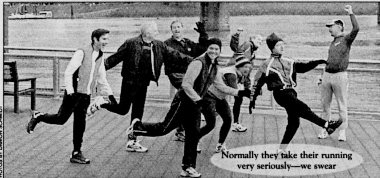
Normally they take their running very seriously—we swear