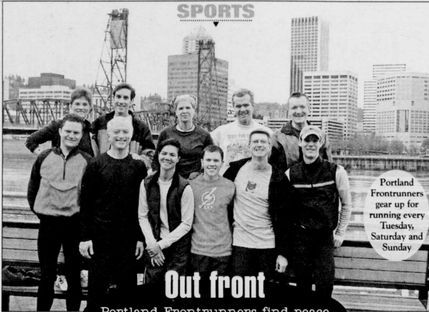
Portland Frontrunners gear up for running every Tuesday, Saturday and Sunday

F rontrunners is an international running club for sexual minorities that began 28 years ago in San Francisco. Since then it has