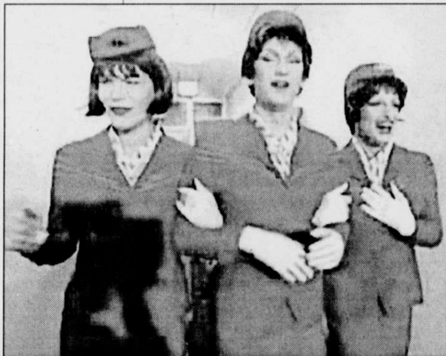
The transvestite trio Sestre is competing in this year's Eurovision Song Contest