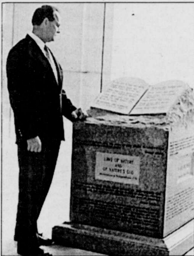
Chief Justice Roy Moore looks at the Ten Commandments monument he commissioned and placed in the rotunda of the Alabama Supreme Court building in August 2001

In 1999, Moore received the Family, Faith and Freedom Citation presented by the anti-gay Family Research Council. He also appeared on Pat Robertson's The 700 Club , D. James Kennedy's Coral Ridge Hour and James Dobson's Focus on the Family .