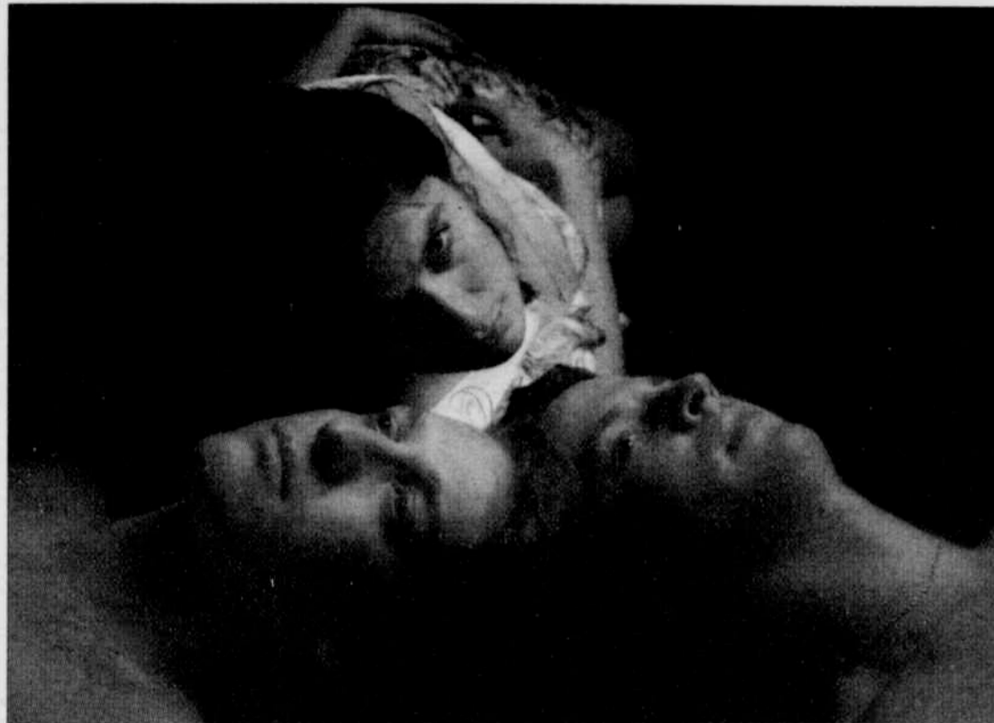
Stephen King on acid—don't miss After the Zipper through March 2 at Stark Raving Theatre

Rural Organizing Project is a network of human dignity groups taking action at the local and state level.