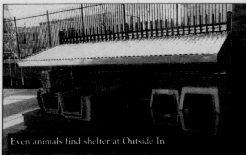
Even animals find shelter at Outside In

Probably the most recognizable activity of Outside In's risk education department is its needle exchange program. Although