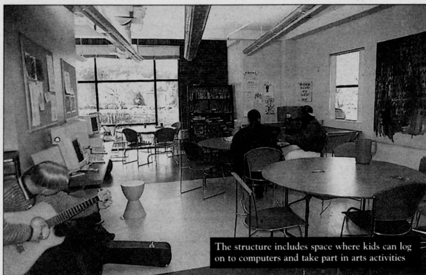
The structure includes space where kids can log on to computers and take part in arts activities

space. Here, youth learn how to seek a job, write a résumé or use a computer.