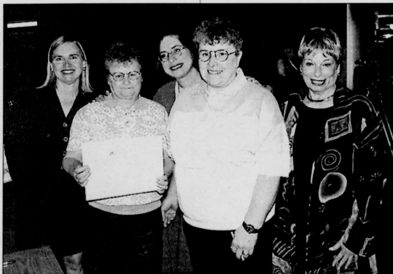
Portland Mayor Vera Katz (right) was recognized by the Northwest Gender Alliance for her support of sexual minority issues, such as Multnomah County's domestic partner registry