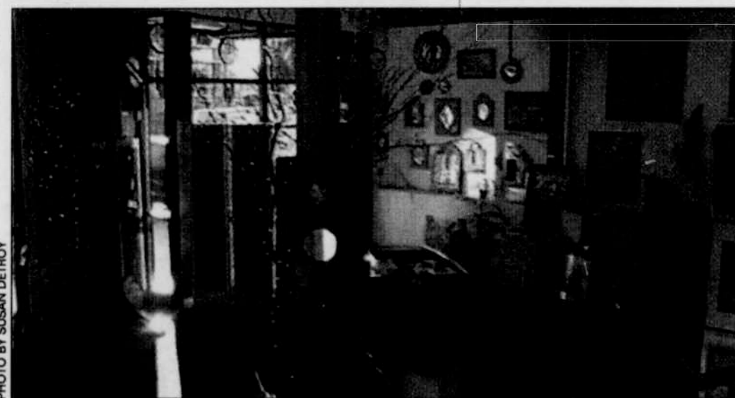
Vivace Gallery is the only place to find existing Sumiche creations—along with a lot of other neat stuff