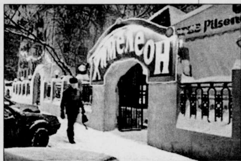
The embassy said two of the murdered foreigners visited the Chameleon nightclub

friendly approach of the [Israeli military] as an example he would proudly use in his deliberations in the U.S. regarding a change in... 'don't ask, don't tell.'"