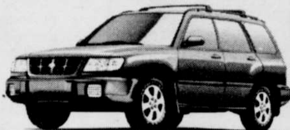
20 automatic's in stock!

PS/PWL/M, AT, tilt, cruise, AC, cass, anti lock brakes and duel air bags. Lots of extras! MSRP $22,323.00 Dealer Invoice $20,245.00 Internet Fleet Sales Price $20,345.00