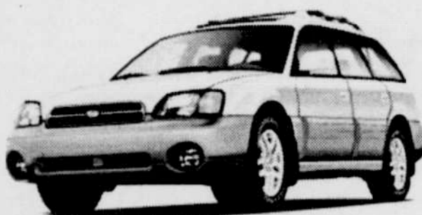
over 50 automatic's and 30 5 speed's in stock!