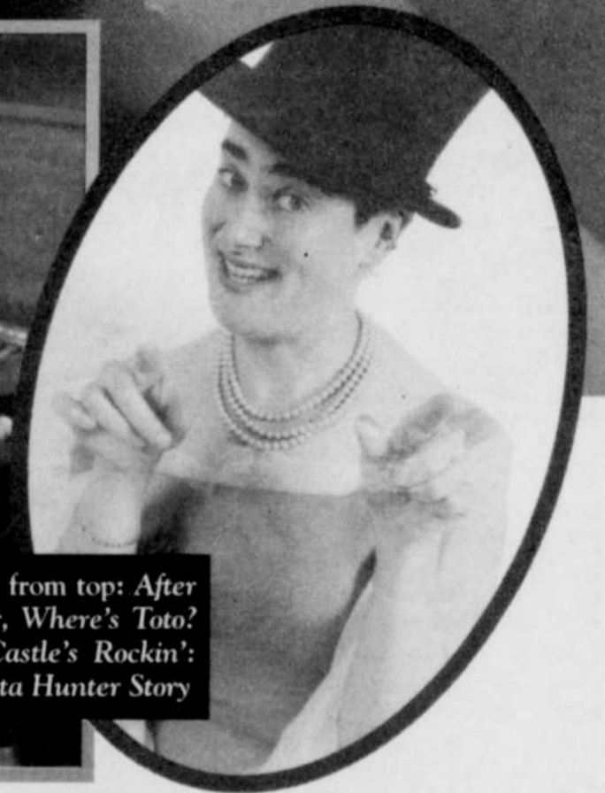
Clockwise from top: After the Zipper , Where's Toto? and My Castle's Rockin' : The Alberta Hunter Story