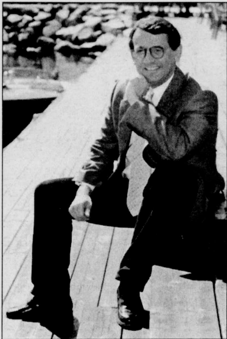
Norway has a gay finance minister, Per-Kristian Foss