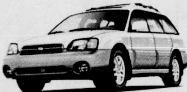
over 50 automatic's and 30 5 speed's in stock!