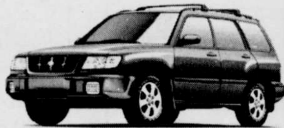
20 automatic's in stock!

PS/PWL/M, AT, tilt, cruise, AC, cass, anti lock brakes and dual air bags. Lots of extras! MSRP $22,323.00 Dealer Invoice $20,245.00 Internet Fleet Sales Price $20,345.00