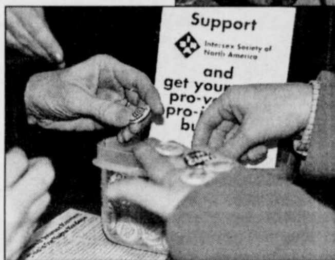
Emi Koyama (right) hands out fliers Dec. 27 as people flock into the Portland Center for the Performing Arts; playgoers buy buttons from demonstrators (inset)

and that they should be altered to match what men desire.