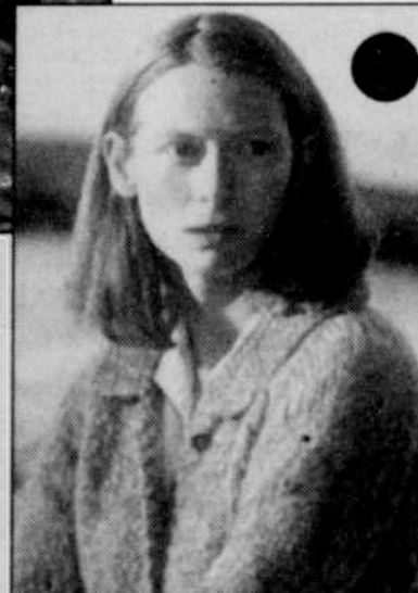
Golden Globe Awards

live from the Beverly Hills Hotel at 8 p.m. Jan. 20. Pull out those Hedwig foam wigs, and keep your fingers crossed.