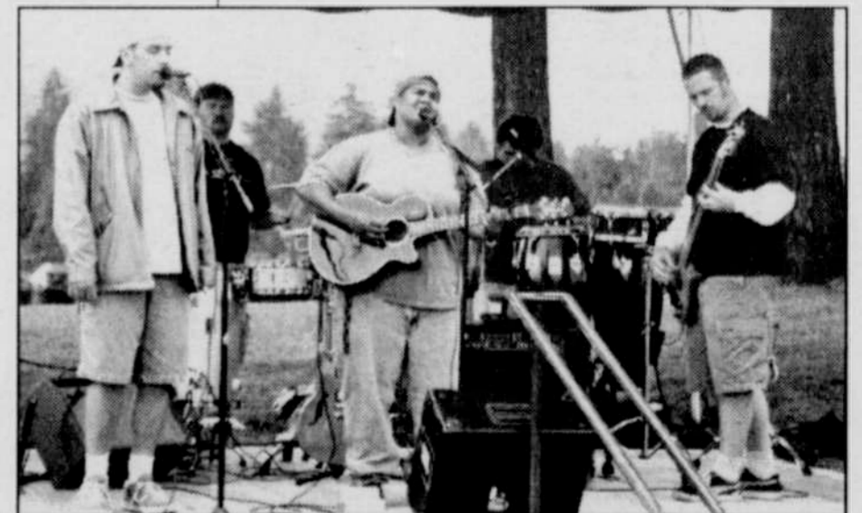
Embra woos with edgy, soulful rhythms