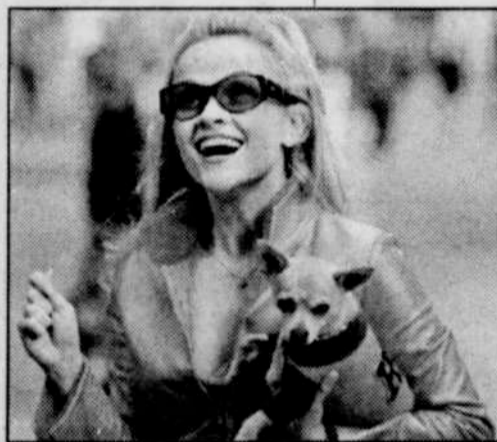
Reese Witherspoon cracked the case in Legally Blonde

Audiences were howling during Legally Blonde when shrewd law student Elle Woods (Reese Witherspoon) deduced a witness was lying about a heterosexual affair after he dissed her dated Pradas.