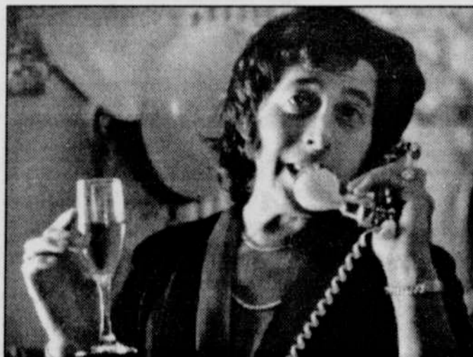
Paul Reubens didn't Blow , but the movie sure did

father figure to a juvenile delinquent but winds up dead. In The Deep End , sleazeball Darby Reese (Josh Lucas) pursues a gay teen but gets what's coming to him. Meanwhile, Paul Reubens (aka Pee-Wee Herman) enjoyed a short-lived comeback after portraying a bisexual hairdresser in Blow but now is the subject of a child porn investigation.