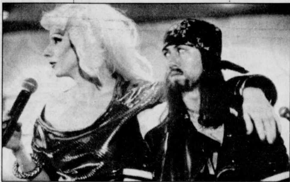
John Cameron Mitchell (left) described his "Barbie doll crotch" in Hedwig and the Angry Inch

This certainly wasn't a good year to be messing around with little boys. In L.I.E. , a pedophile (Brian Cox) becomes a fractured