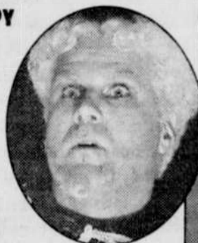
Will Ferrell played a flaming fashionista in Zoolander

First we learn Adolf Hitler might have been gay, and now this. In Zoolander , Mugatu seeks fashion industry domination by brainwashing a dumb male model into assassinating Malaysia's president, who is cracking down on sweatshops. Although the villain never officially confirms his sexuality, actor Will Ferrell's fruity portrayal leaves little to the imagination.