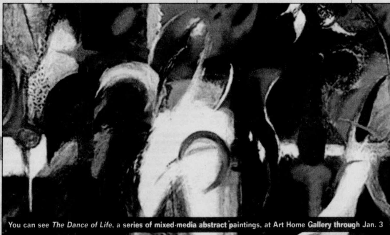
You can see The Dance of Life , a series of mixed-media abstract paintings, at Art Home Gallery through Jan. 3

See Page 47 for a list of New Year's Eve events.