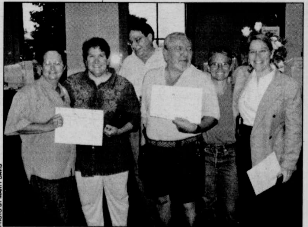
Couples celebrate their domestic partnership registry