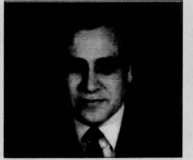
Israel President Moshe Katsav disappointed gay activists when he told them, "I don't see how I can help you"

The Jerusalem Post commented: "If they [gay activists] thought that they had found an ever open door at the pinnacle of the establishment, they were mistaken.... There was a clear implication that he did not want to be bothered by a bevy of gay groups or individuals."