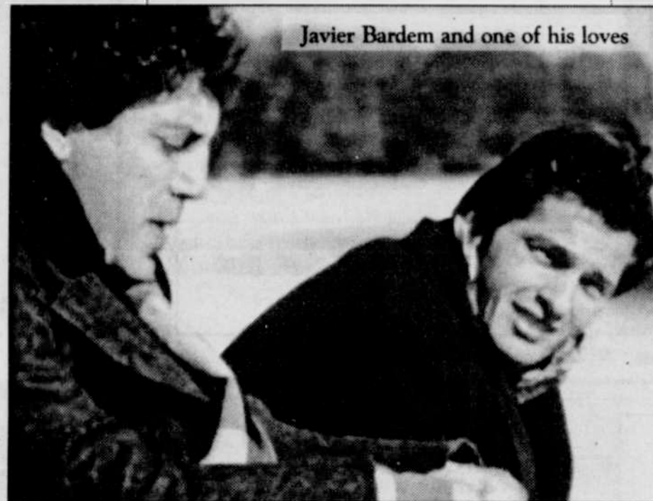
Javier Bardem and one of his loves

to his time in the Cuban rebels, winding to his later years as a poet and writer in Havana. Along the way, he discovers he serves two lovers: men and his typewriter.