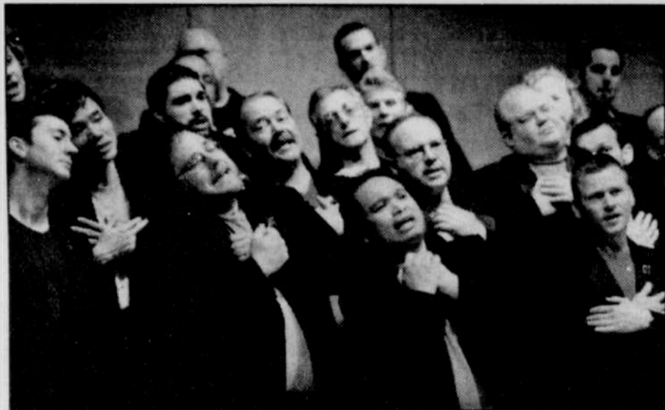
Members of the Portland Gay Men's Chorus hope and pray you'll lend them your ears!