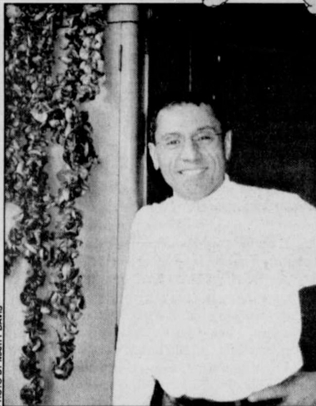
HGTV digs his digs