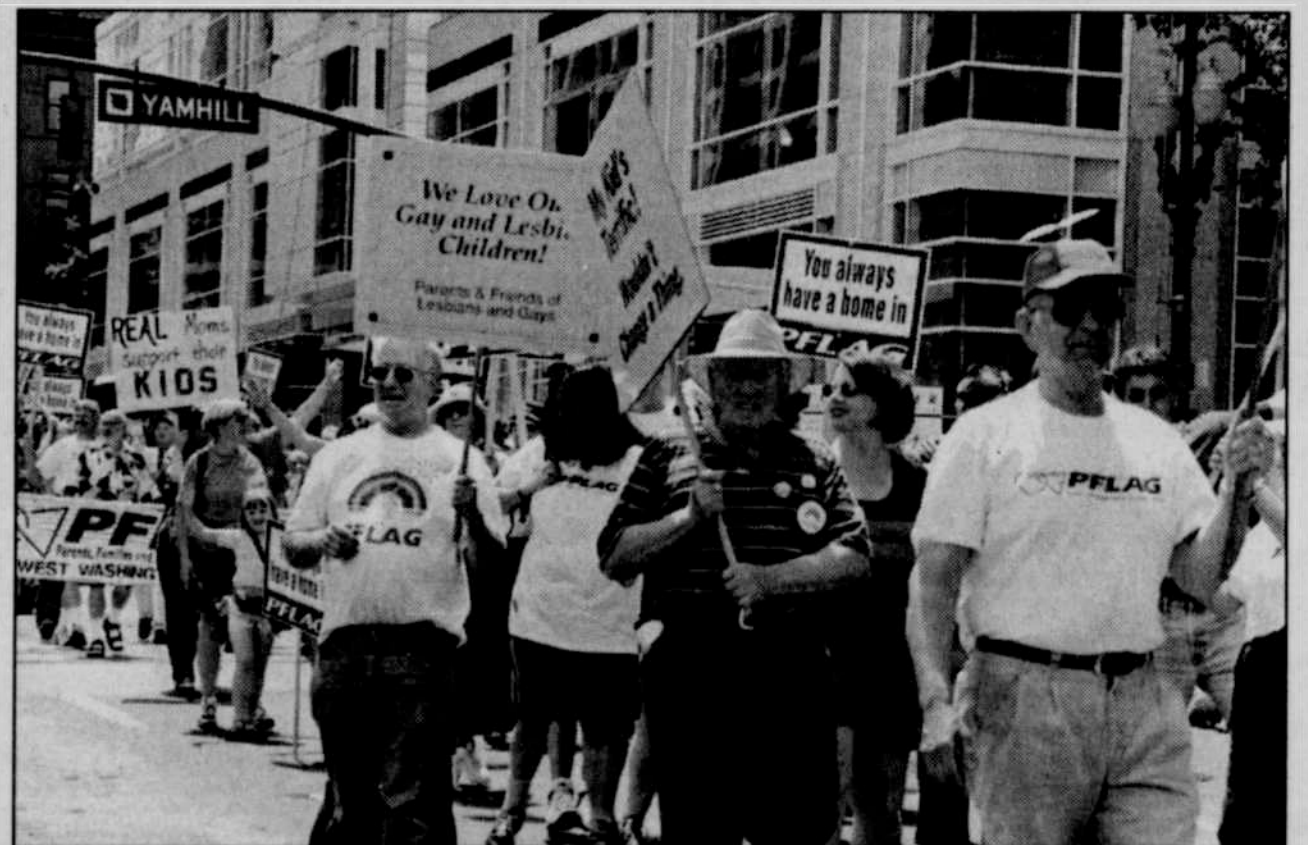
You'll never meet a nicer bunch of folks than these

The whole group later reassembles for a question-and-answer session. The questions are anonymous, and anyone is welcome to join in with an answer. □