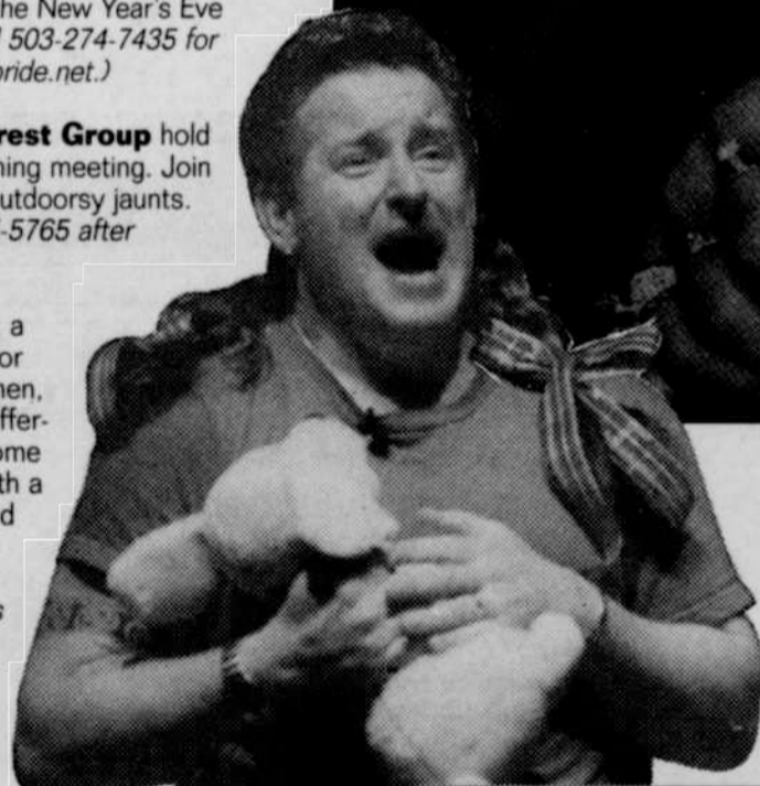
Olé! Enjoy the Spanish flavor of the Portland Gay Men's Chorus Holiday Voices concert Dec. 15 and 16