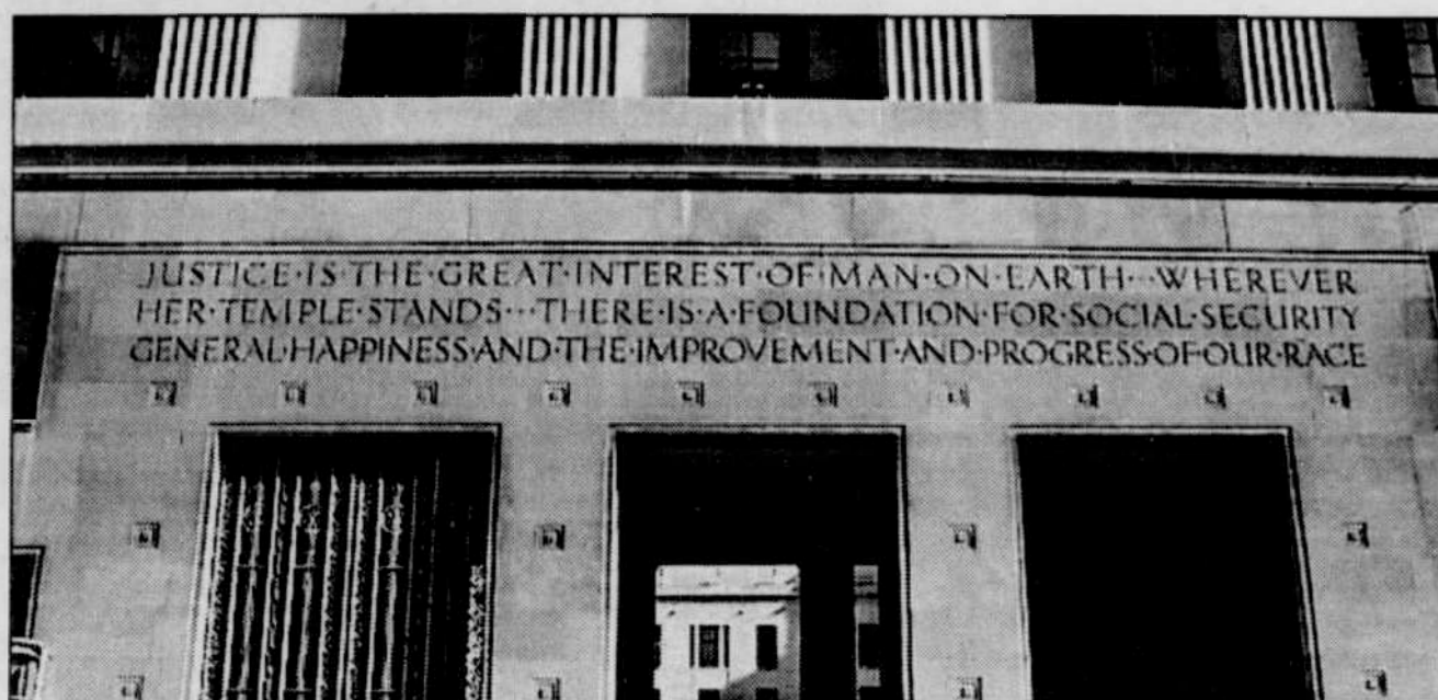
The Justice Department is being urged to allow surviving lesbian and gay partners access to the September 11th Victim Compensation Fund