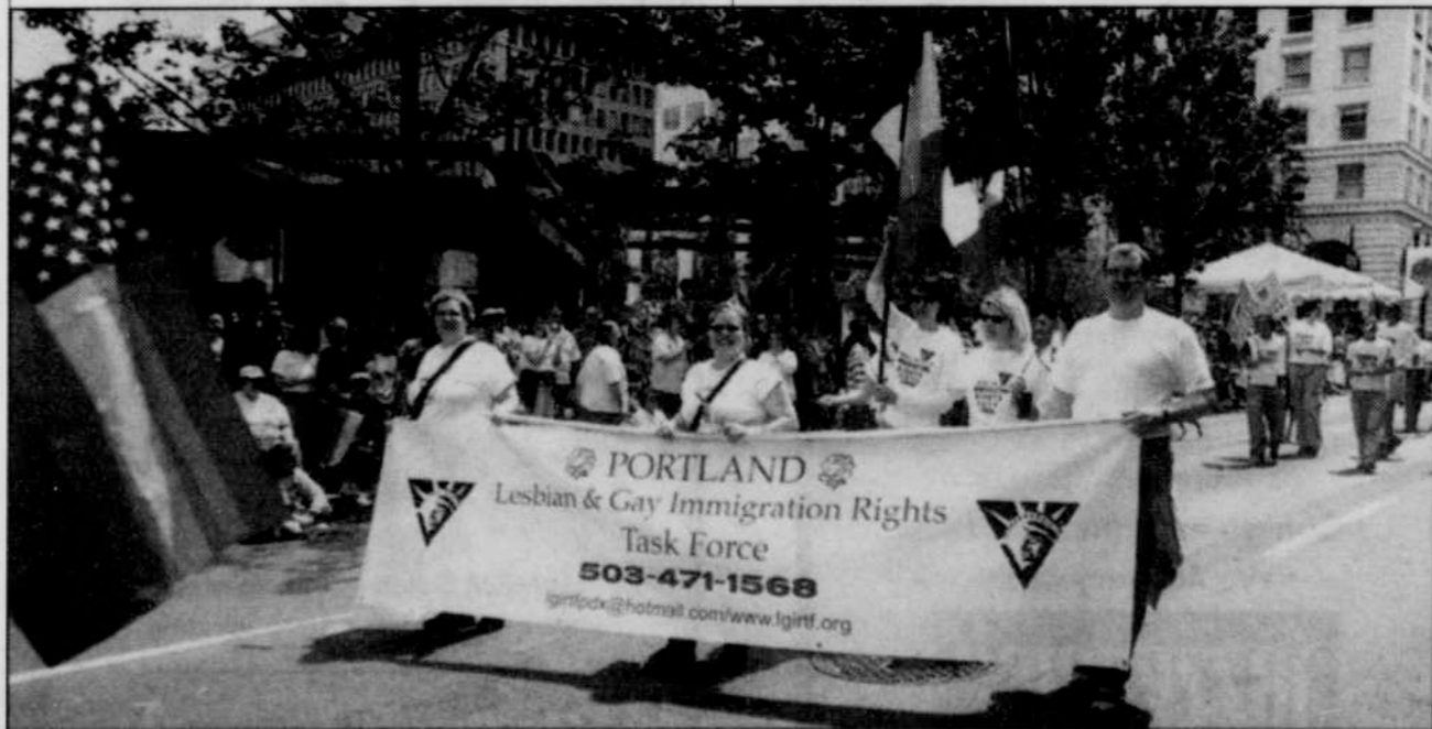
The Lesbian and Gay Immigration Rights Task Force provides support and information to same-sex binational couples