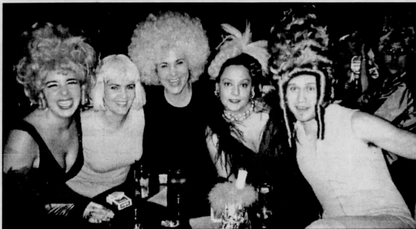
A wig-diggity time was had by all at last year's Wig Out

Leave the bird to defrost and head out for some fun with numbers. The Rose City Softball Association serves up Turkey Bingo from 7 until 10 p.m. Nov. 21 at Embers Avenue, 110 N.W. Broadway. All proceeds go to the Portland World Series 2002 fund. Come gobble up the prizes—they promise lots of "turkeys" to choose from, or perhaps you'll get gobbled up yourself!