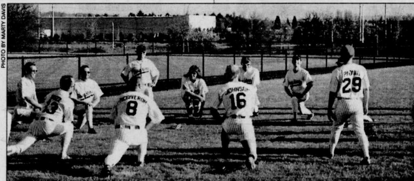
Spring training might be a long way off, but the RCSA needs to raise money now