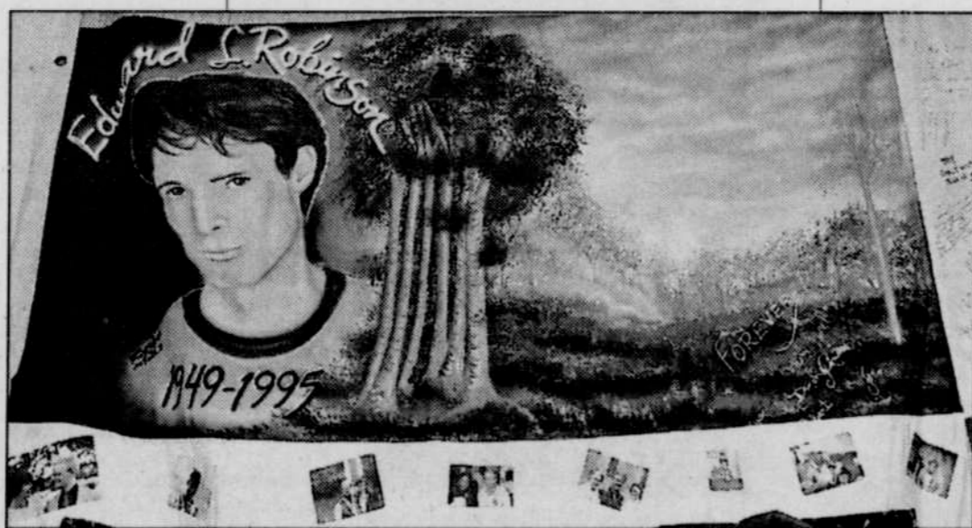
Portions of the AIDS Memorial Quilt will go on display throughout the state during the coming weeks

• Salem: Queen of Peace Catholic Church, 4170 Pullman Ave. S.E. (Nov. 24-Dec. 2). JR