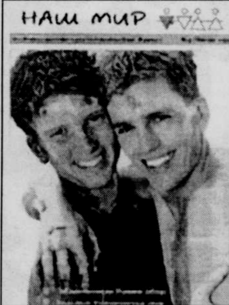
Ukraine's gay community center publishes the magazine Our World