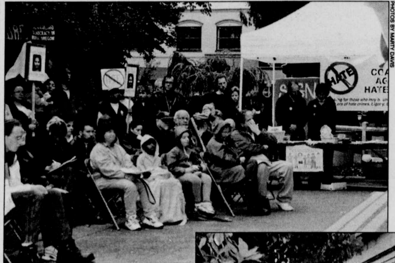
Dozens of people gather for the Rally Against Hate on Oct. 7 at the Washington County Courthouse in Hillsboro